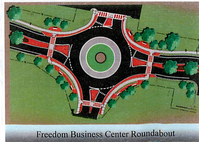
Freedom Business Center Roundabout