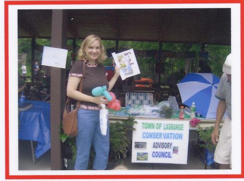
Adult participants receiving CAC brochures on the environment