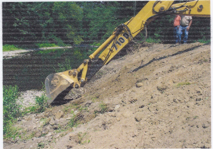
Step 1: LaGrange Highway Dept shapes bank