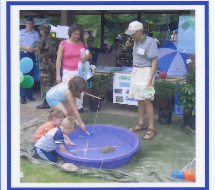
Young participants enjoying the magnetic fishing game in front of the CAC booth.