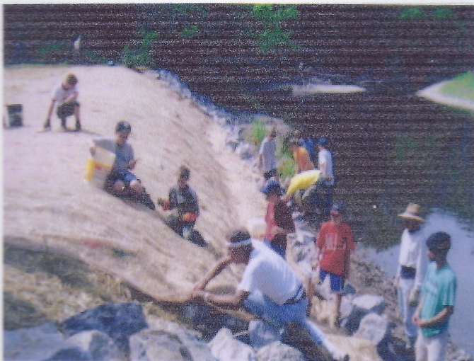
Step 4: Bank with mats near completion