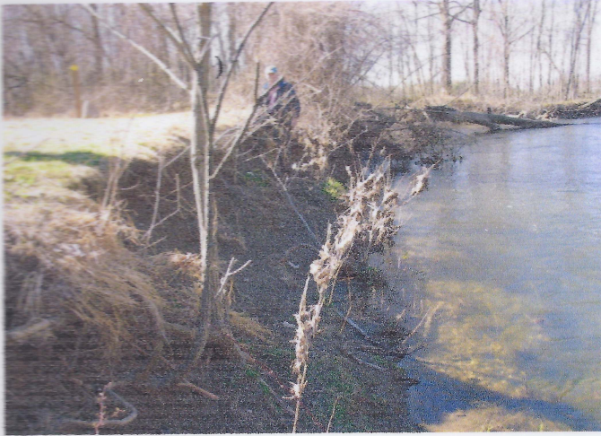
BEFORE: Severe bank erosion