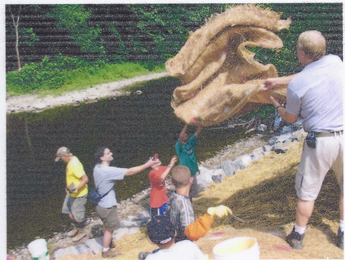
Step 3: Stabilizing mats placed over grass seed