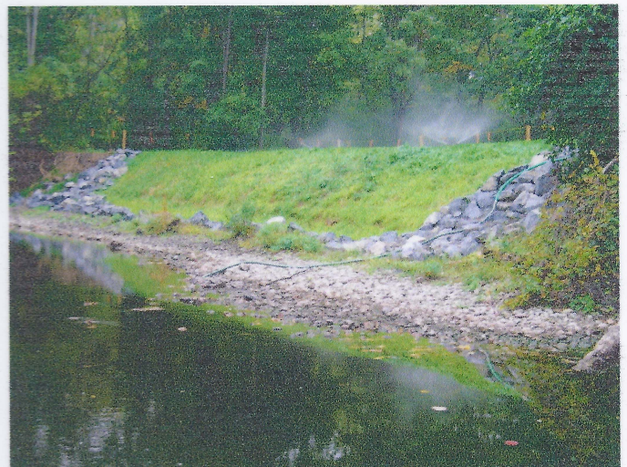
AFTER: Phase 1 complete (grass only)