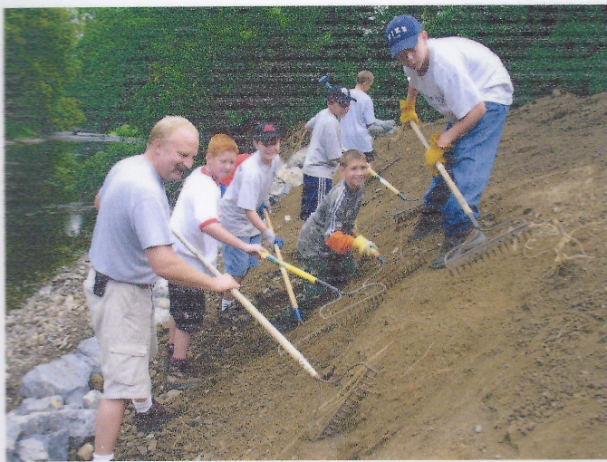
Step 2: Boy Scouts rake and seed bank